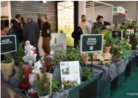
Different growers represented at Gasa.