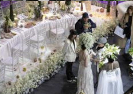
Weddings are huge in Italy and next to food, flowers are one of