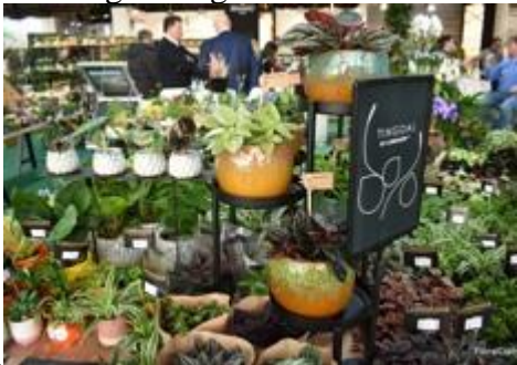
the interest for climate control solutions is increasing. Tingdal