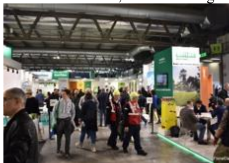
they are offering irrigation solutions.