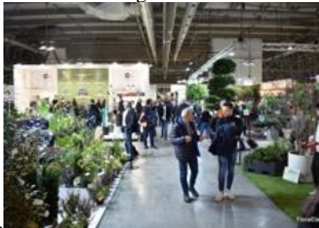
years. In the UK, Denmark and Italy. exhibition floor.