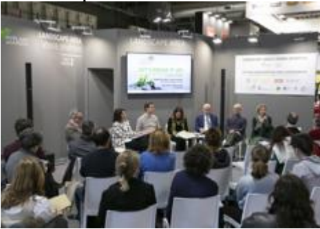
Presentations being held