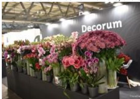
more known in Italy.