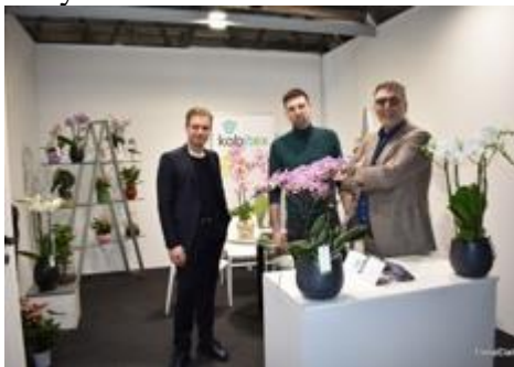
The teaming Kobitex, a Dutch company that exports all kind of