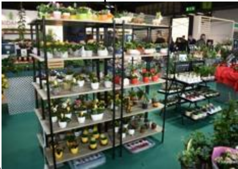
Group booth. Also Eurotrend products at the Gasa booth.