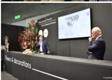
World of spray roses presentation to inspire florists.