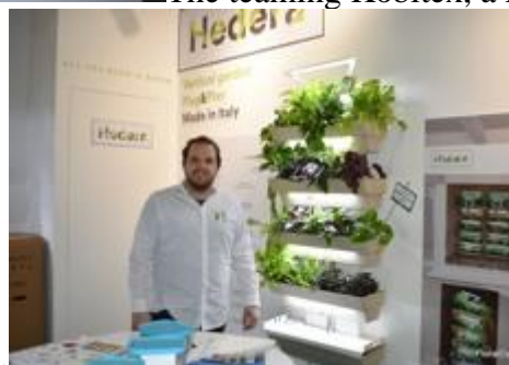
plants and flower o Italy.