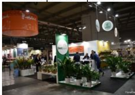
fair for the first time. The GREEN booth with Dutch companies