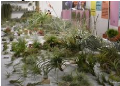
Table full of Tillandsias.

Citrus trees could not be missed at the show.