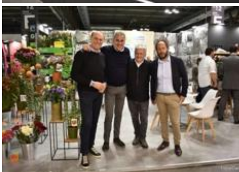
The team of Flora Toscana, a cooperative of 230 growers founded in Pescia, in Pistoia's province. The company has been present on the floriculture market