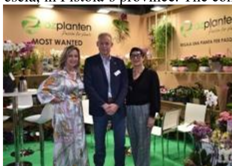
for 50 years. The team of OZ planten. This company is