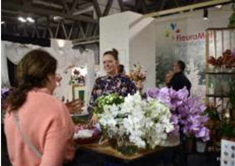
At FleuraMetz, there is a lot of interest for the creations that are