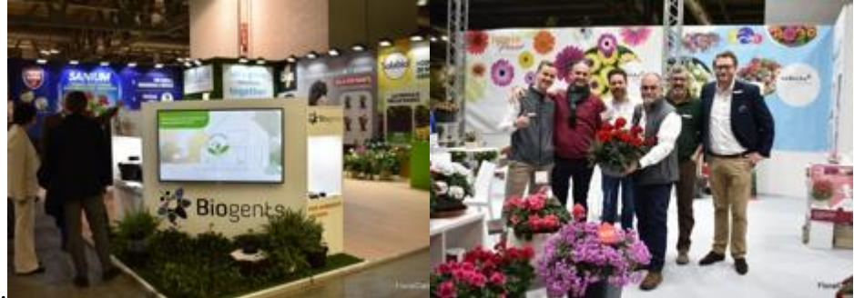
green fiber and 20% coco. Team of Selecta one presenting Tumbao. Striking about this pelargonium is the contrast of red flowers and dark leaves and that it survives in hot climate, like Italy. The variety is becoming increasingly more popular and more and more people start to know it by name, like Pink Kisses.