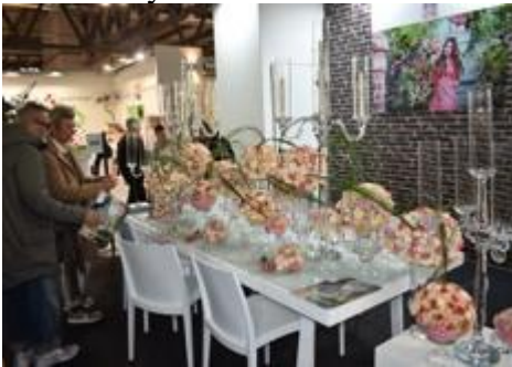
Table filled with roses from World of Roses.

components of weddings. Sunrise will introduce a new line the end of May. These new lisianthus line with big flowers will be available at all Dutch actions.