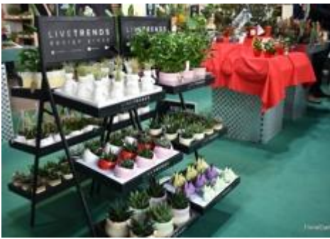
as well as Livetrends products at the Gasa booth.