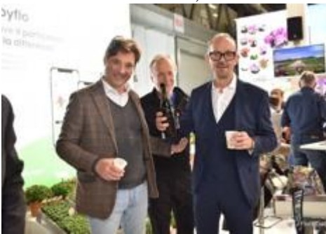
Always busy at the booth of Padana.