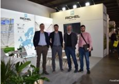
The team of Richel.