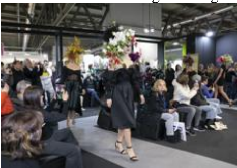
the main ingredients.