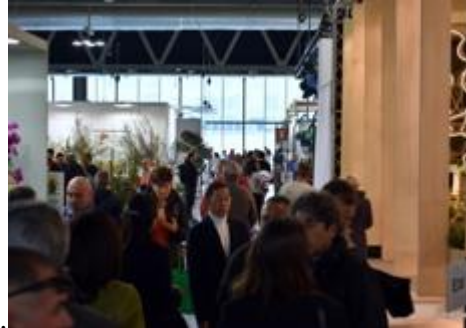
They are in the business for more than 55 years.