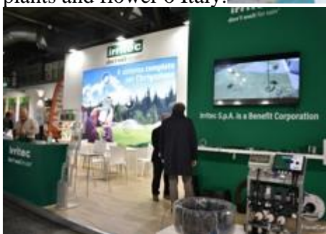
Don't wait for rain, that's the slogan if irritetec. Since 1974