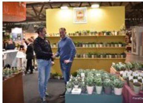
being made at the booth by a designer.